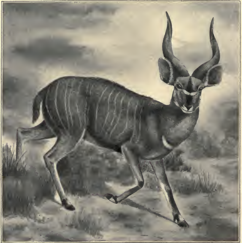
FIG. XVIII. BOÖCERCUS EURYCERUS. BONGO.

Boocercus eurycerus isaaci Thos., Ann. Mag. Nat. Hist., 7th Ser., x, 1902, p. 309. Id. Proc. Zoöl. Soc., 1902, p. 319.